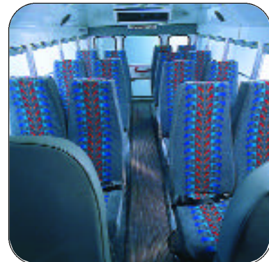
Optional activity seats for added comfort

Optional high-back activity seats offer eye appeal as well as versatility and comfort.