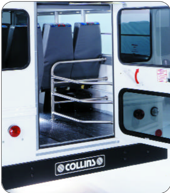
There are a number of options available

Collins buses offer everything you could imagine, and many things you can only get in a plush conversion van.