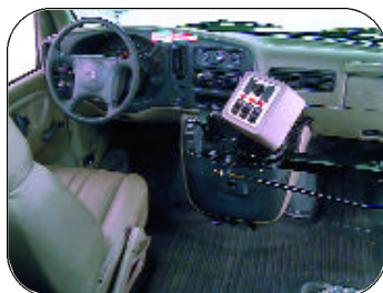
Ergonomic dash designs allow for maximum comfort and control

With all of its enhanced safety and comfort, under most state laws, anyone with a regular drivers' license can operate a Collins AAV as long as it doesn't hold more than 14 passengers. You get all the safety of a small school bus, while avoiding the added expense of hiring additional commercial drivers.