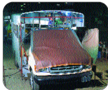
Steel construction safety cage for added strength and peace of mind

Perhaps the biggest surprise to church administrators is how little price difference there is between a non-conforming van and a Collins AAV. The Collins AAV costs about 10% more than a van, but the advantages far outweigh the expense. That's because the Collins AAV life expectancy is substantially longer than a van, giving you additional service life and the peace of mind knowing you're giving your members the safest ride possible – all while protecting your church from potential liability in the event of an accident involving a non-conforming van.